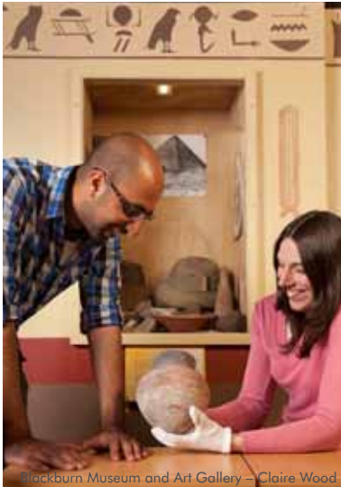
Blackburn Museum and Art Gallery – Claire Wood

“Collaborating with the School of Egyptology at Liverpool allowed for the academic skills and knowledge of the university students and staff, and the practical museum skills of the curators to be used together. The documentation work, and subsequent exhibition would not be the quality it is without the two working in partnership.”