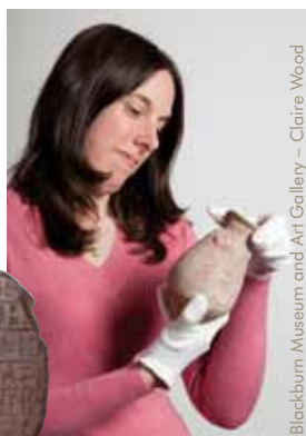
Blackburn Museum and Art Gallery – Claire Wood

“The Egyptology review has allowed more knowledge to go into the school loan boxes programme, provide more information on the provenance of the objects and allow a re-interpretation and re-exhibit of the permanent gallery.”